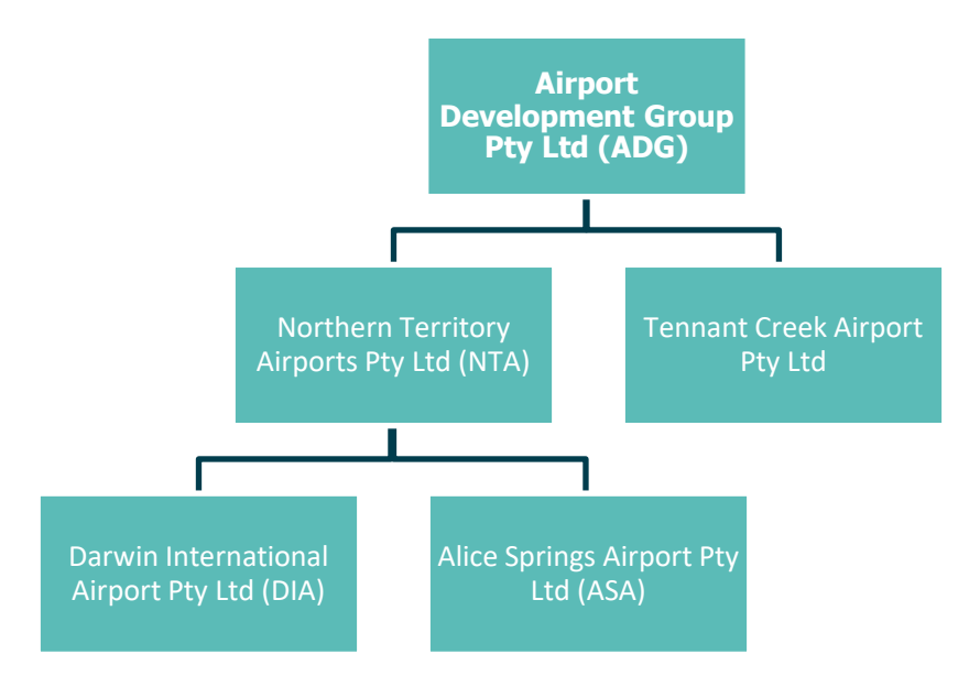
Figure 1: Company Structure

ADG also owns 100% of Tennant Creek Airport Pty Ltd (TCA) who are the holders of a 50-year lease over Tennant Creek Airport with free option for a further 49 years.